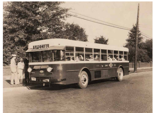
This modern technology made most rail transit obsolete: Introduced in 1927, the Twin Coach bus was less expensive to buy and less expensive to operate than rail transit yet could move more people per hour than all but the highest-capacity rail lines.

In contrast, the transit infrastructure backlog has steadily grown because the transit industry has been too busy building new transit lines to maintain the ones it already has. In 2009, the Federal Transit Administration reported to Congress that the nation's rail transit agencies had a $50 billion maintenance backlog . Yet transit agencies weren't even spending enough on maintenance to keep the backlog from growing. As a result, by 2019, that backlog had grown to $174 billion .